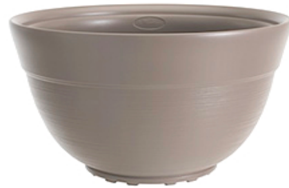
G (dove gray)